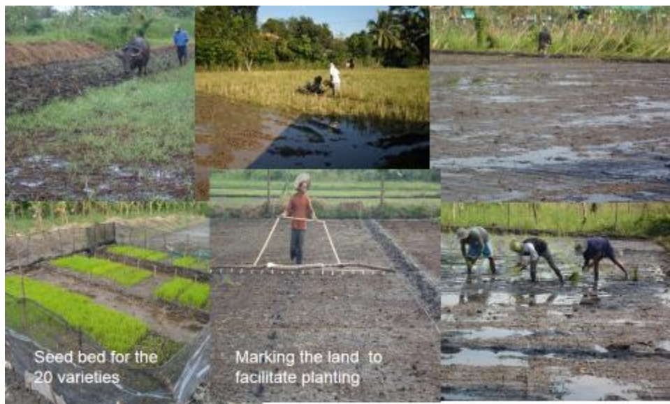
Fig.1. Crop establishment from land, seedlings preparation, marking prepared land to facilitate planting at 1 seedling/hill.

d) At grain filling period, another preparation was applied. The middle soft tissues of the banana stem after harvesting the whole bunch of banana, were obtained, cut into small pieces and mixed with molasses at 1:1 ratio by weight. This mixture was allowed to ferment for 3 weeks and diluted at 1:10 fresh water ,then sprinkled the diluted solution to the test plots. Figure 1 shows the crop establishment starting from land and seedling preparation, marking the field to facilitate planting at one seedling per hill.