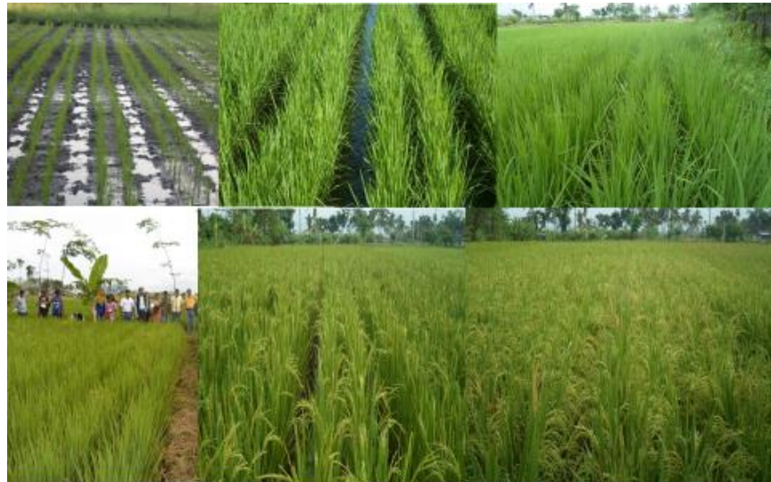
Fig.2. The double row planting pattern (20x10cm—40cm) at various growth stages.

This led us to try the double row spacing at 40cm between 2 rows and 10 cm between hills (the plant density at 333,000 hills) and also single row at 40cm x 10 cm whose plant population was the same with the 20cm x 20cm spacing at 250,000 hill per ha. The wide space (40cm) between the double rows (Fig.2) remedied the earlier difficulties that was encountered when doing rotary and hand weeding in the 20cm x 20cm spacing. It was so easy and convenient to pass in-between- the larger interval rows. This allowed us also to pass the rotary weeding more frequent as the weeds emerge as it was faster and easier. (The large space between the double row allows Muscovy ducks to graze favoring rice + duck integration). Since there was wider spacing, there was extended canopy closure, in turn, extended duration of weeding. It is important to point out that only once rotary weeding was done in the narrower 20 cm x 10cm double rows as the canopies closed –in quickly. Any remaining weeds were removed manually.