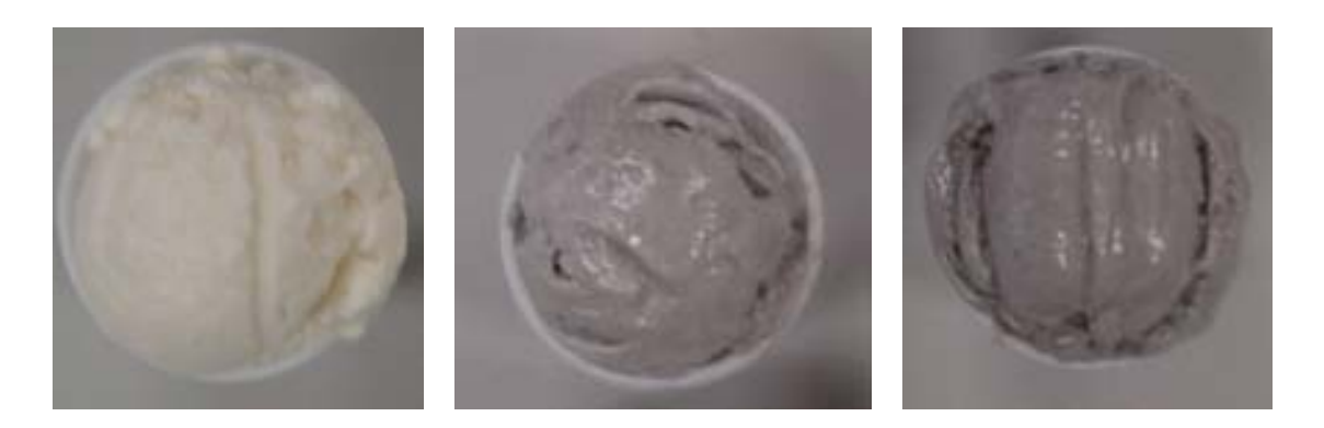
Figure 1. Plain soy milk ice cream, 5 and 7% (w/v) ground toasted black sesame seed added samples.