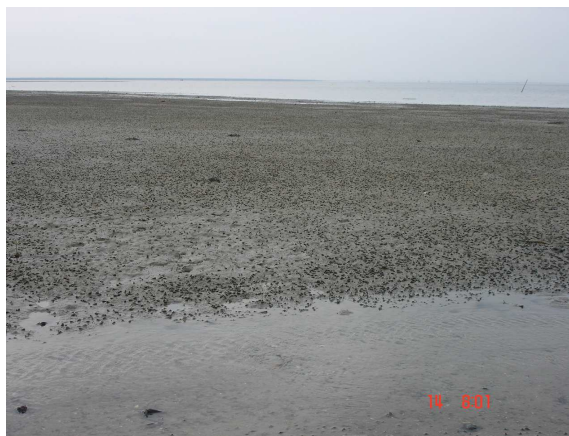
Figure 4. Area of sediment deposition.