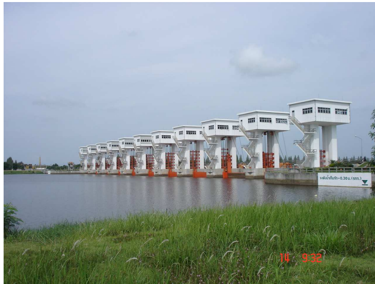
Figure 2. The Uthokawiphatprasit Watergate.