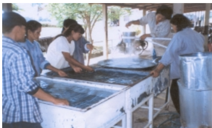
Fig. 2. Village plant for producing vermicelli made from mungbeans

Food and Fertilizer Technology Center (FFTC) 14 Wenchow St., Taipei, Taiwan ROC Tel.: (886 2) 2362 6239 Fax: (886 2) 2362 0478 E-mail: fftcc@agnet.org Website: www.fftcc.agnet.org