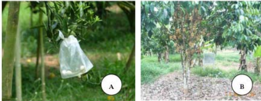
Figure 1. Napthalene in plastic bag hanging on citrus shoot (A) and longkong plantation (B).