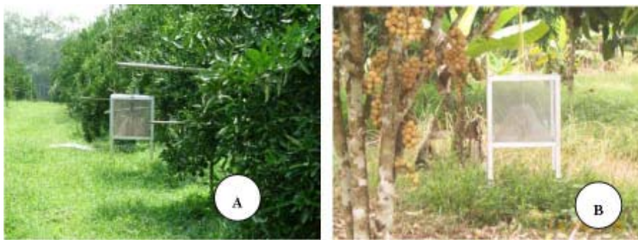
Figure 2. Insect cages for trapping the FPMs in citrus (A) and in longkong (B).

FPM species were recorded, and their diversity was calculated with Simpson's index ( D_s ):