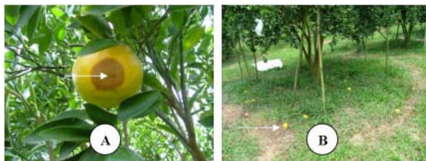
Figure 5. A) Damage symptoms caused by the FPMs in citrus (arrow). B) Damaged fruits fall down under the bush (arrow).