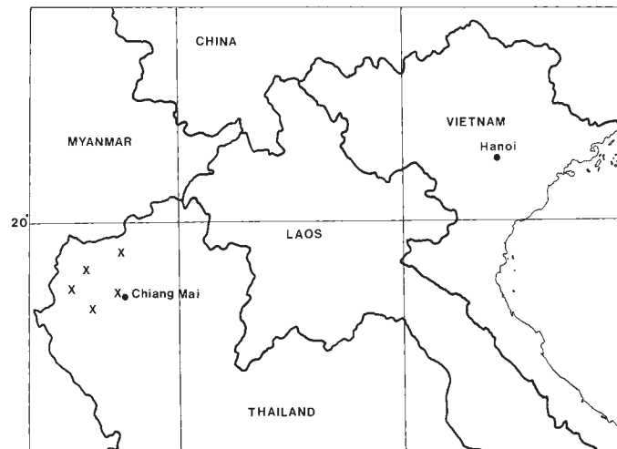
FIG. 2. Distribution map of Agapetes thailandica S. Watthana.

Agapetes thailandica is a very distinct and interesting species. It is widely glabrous with large, spirally arranged leaves. The pedicel is filiform and not articulated with the calyx. The anthers are slightly dimorphic, not in size, but the spurs vary between widely and narrowly angled on alternate anthers (Fig. 1C,D). Agapetes kanjilalii A. Das from Assam has similar long, glabrous stamens with recurved spurs. It differs from A. thailandica in having pubescent stems, pedicel and calyx and although the leaves are of similar shape they are much smaller (2.5–3.0 × 0.7–0.9cm). The corolla also is longer in A. kanjilalii (c.3.8cm) and the pedicel is shorter (5.0–6.0mm) and, unlike the present species, is articulated at the apex. Agapetes neo-caledonia Guillaumia is also described as having the pedicel continuous with the calyx, a rare condition in the genus Agapetes (Stevens, 1972). This New Caledonian species is in any case widely removed geographically from the location of the new species and is in subgenus Paphia (Stevens, 1972); the present species is in subgenus Agapetes . The only other species of Agapetes subgenus Agapetes reported to have a continuous