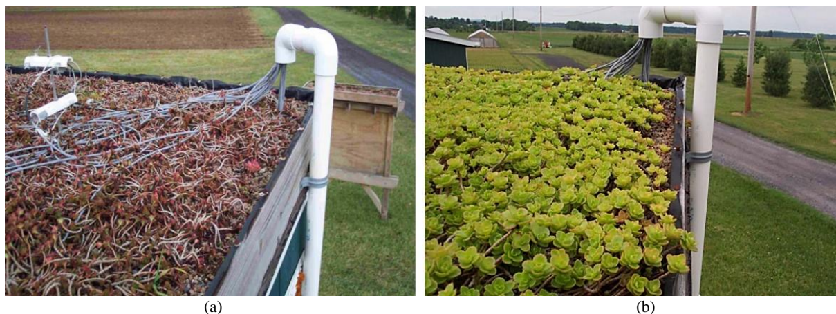
Figure 6 An example of a green roof in a SUDS: (a) in November 2003 and (b) in June 2005 [57]

Stormwater runoff has recently been a topic under discussion. This is largely due to the immeasurable damage it causes socially, environmentally and economically. Therefore, measures addressing this issue should be implemented. Recent research has shown green adoption measures to be more sustainable and eco-friendly than most