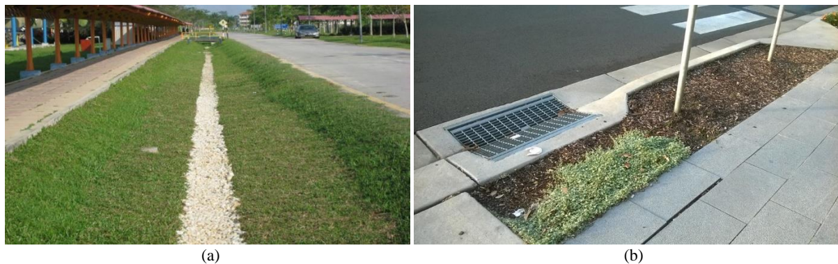
Figure 3 a: An ecological swale with river gravel making up a flow channel [26]; b: SUDS at the Royal North Shore Hospital, Sydney, Australia

Figure 3a shows an ecological swale [26] developed by the University of Sains in Malaysia to simultaneously reduce surface runoff velocity and increase infiltration. River gravel was used to enhance the porosity of the contact ground to increase the infiltration.