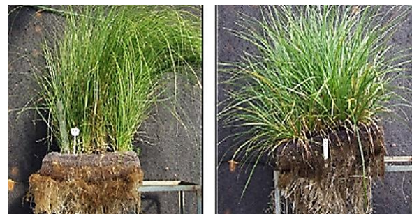
Figure 4 Plants from vegetated floating mats [29]

Additionally, climate change [30-31] and urbanization [29, 32] are believed to be two of the main reasons for urban flooding. Many researchers have found that the frequency and magnitude of flooding are increasing as a result of climate change. Concurrently, urbanization plays an important role in degrading the quality of stormwater. Therefore, SUDS can be an effective solution to aforementioned issues of stormwater runoff.