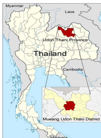
Figure 1. Mueang Udon Thani district location in Udon Thani province, Thailand

The water quality parameter of Mak Khaeng canal was investigated by using PCD-WQI. The water quality parameter of water quality assessment was five parameters namely dissolved oxygen (DO), biochemical oxygen demand (BOD), ammonia (NH 3 ), fecal