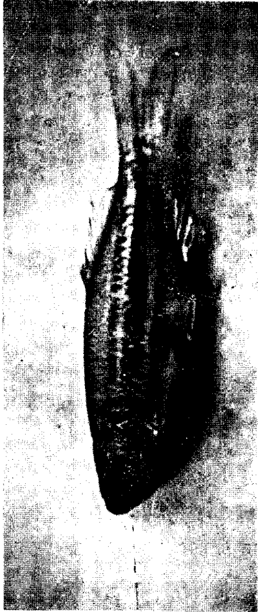
Fig. 2 Danio regina . Formaldehyde preparation, P.J. phot.