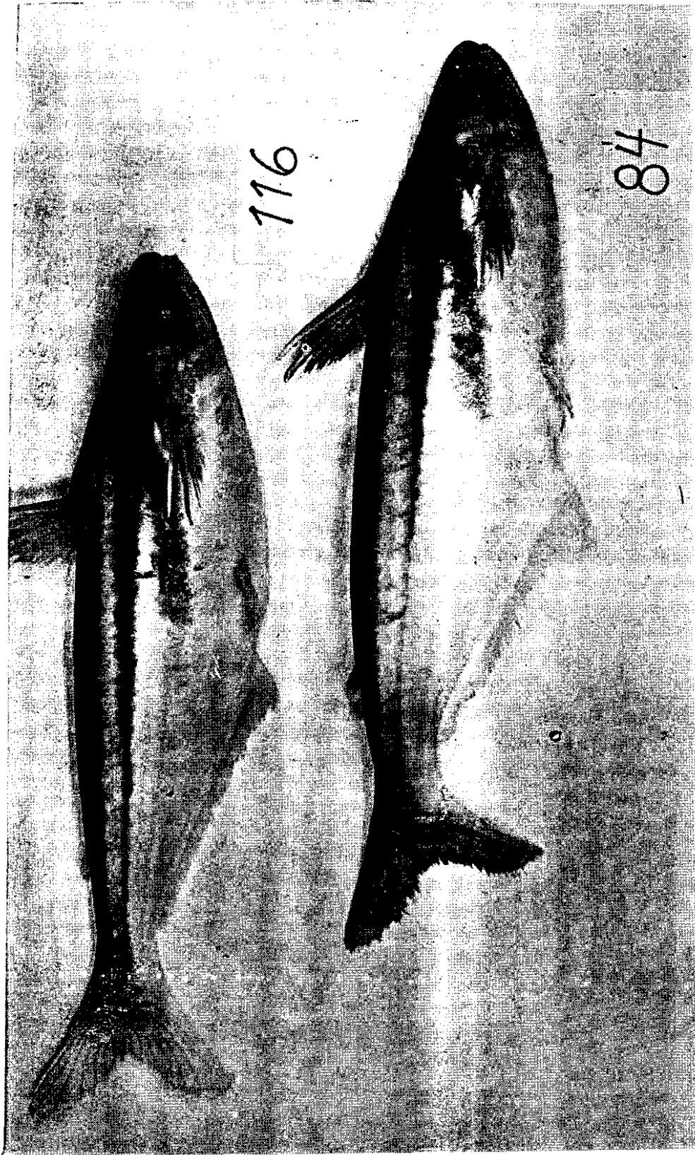
Fig. 4 Pteropangasius cultratus . Formaldehyde preparation.