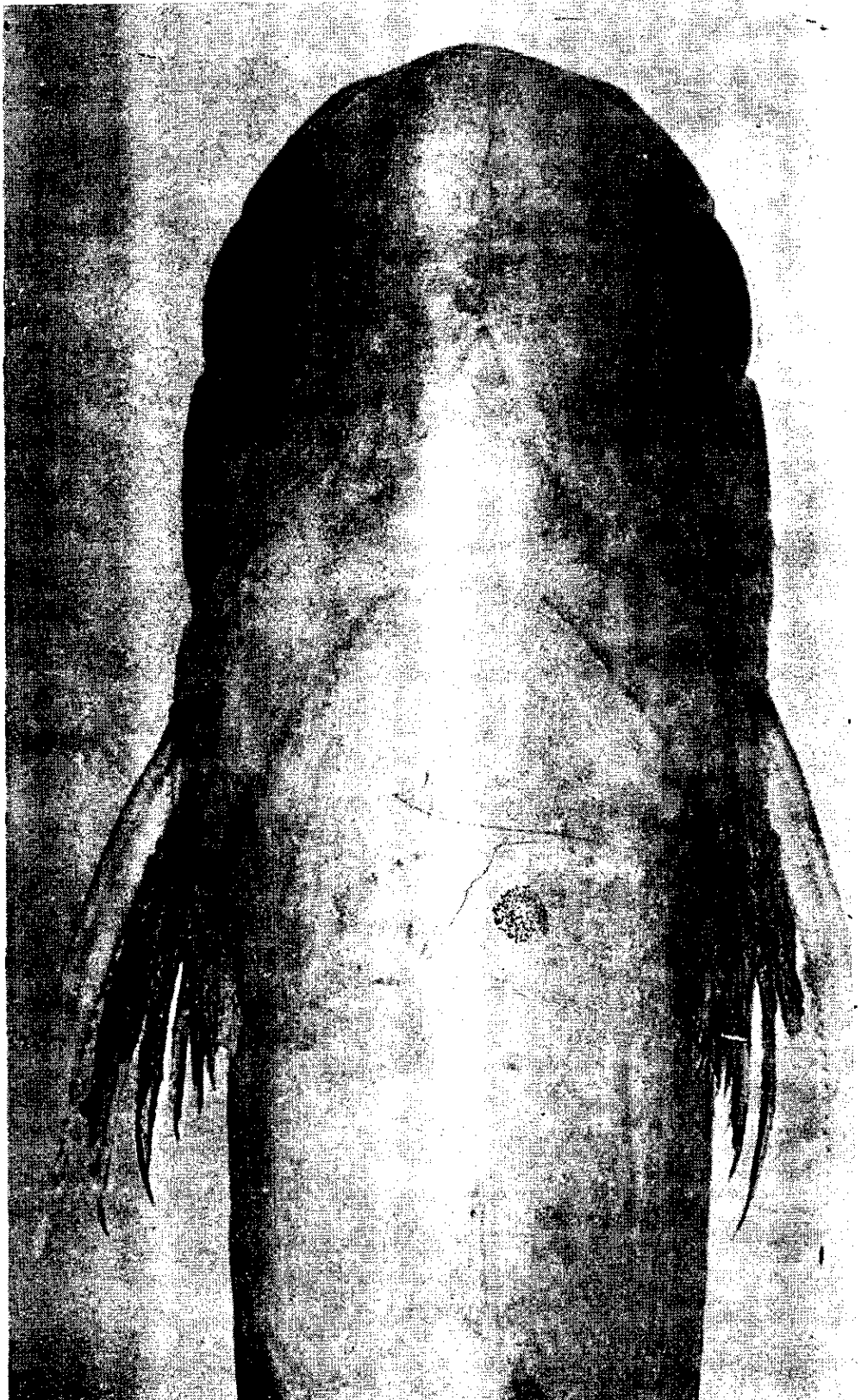
Fig. 5 Pteropangasius cultratus . Ventral view of lowermost fish in fig. 4, to show ventral position of eyes. Formaldehyde preparation. M. Thaarup phot.