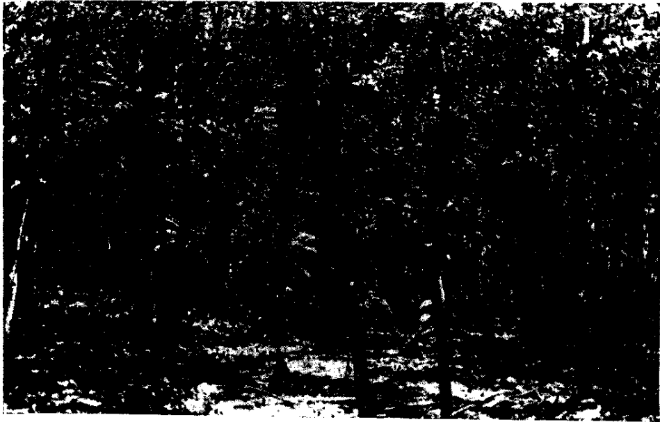
Beach forest of Koh Rah. Cycas rumphii , Planchonella obovata and Morinda citrifolia ; dark-stemmed trees are Casuarina equisetifolia .