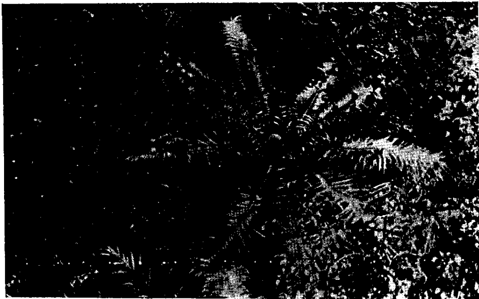
Cycas rumphii , male cone, Koh Pu.