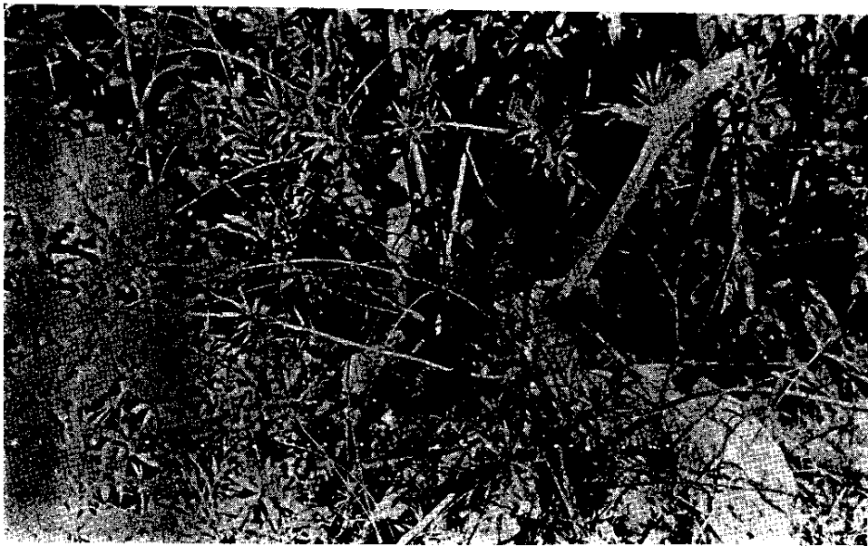
Styphelia malayana on a cushion of moss ( Leucobryum ), Terutao.