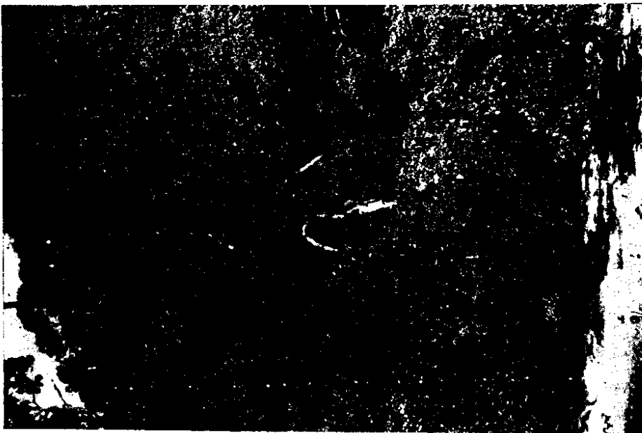
Type specimen of Aesandra krabiensis , beach of Laem Nang.