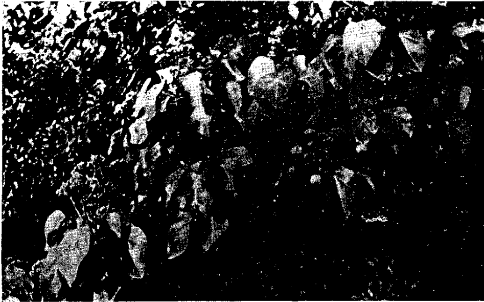
Hernandia peltata at Koh Pipidon.