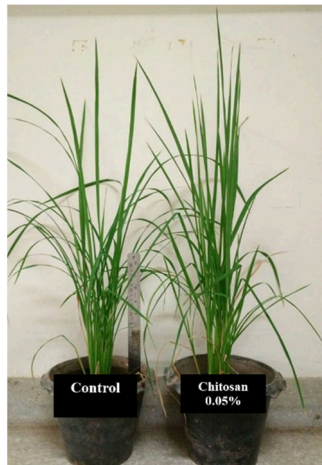
Figure 3 Rice plant were applied by chitosan concentration 0.05% w/v and control.

Soaking and spraying 10 rice cultivars in chitosan before and after planting accelerated the root and total dry weight. It was found that as a result of chitosan used with 0.05%w/v, total dry weight of RD9, PL2 and RD47 were 19.95 g, 16.45 g and 16.45 g (Table 6), respectively highest as compare with the control (Fig 3). Moreover, the relative photosynthesis, tiller plant -1 and number of leafs of RD9, RD47, PL2 and RD41 increased significantly (by 4 weeks) at 48.25, 31.46, 30.12 and 24.57%, respectively (Fig 2b). A similar positive influence of chitosan on rice cultivar features was also observed in foliar (Boonlertnirun et al., 2008). A maximum dry weight of 2,620 g Tr -1 was obtained compare to 2,383 g Tr -1 from the control by seed soaking and foliar spraying. The research by Katiyar et al. (2015) showed a positive chitosan stimulation on various crops were accelerated the plant growth and enhanced process in developing stage. Since N-acetylchitosaccharide from chitosan molecule caused higher root growth involving chemo/physiological of the cell. Again, this results were supported by the work of Mondal et al., (2012) who reported that the morphological, growth, biochemical parameter and yield attributes of okra were enhanced with the application of chitosan.