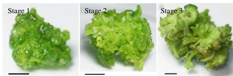
Fig. 2 Developmental stage of callus observed on Kalanchoe rhombopilosa explants after cultured for 8 weeks (bar = 5 mm)