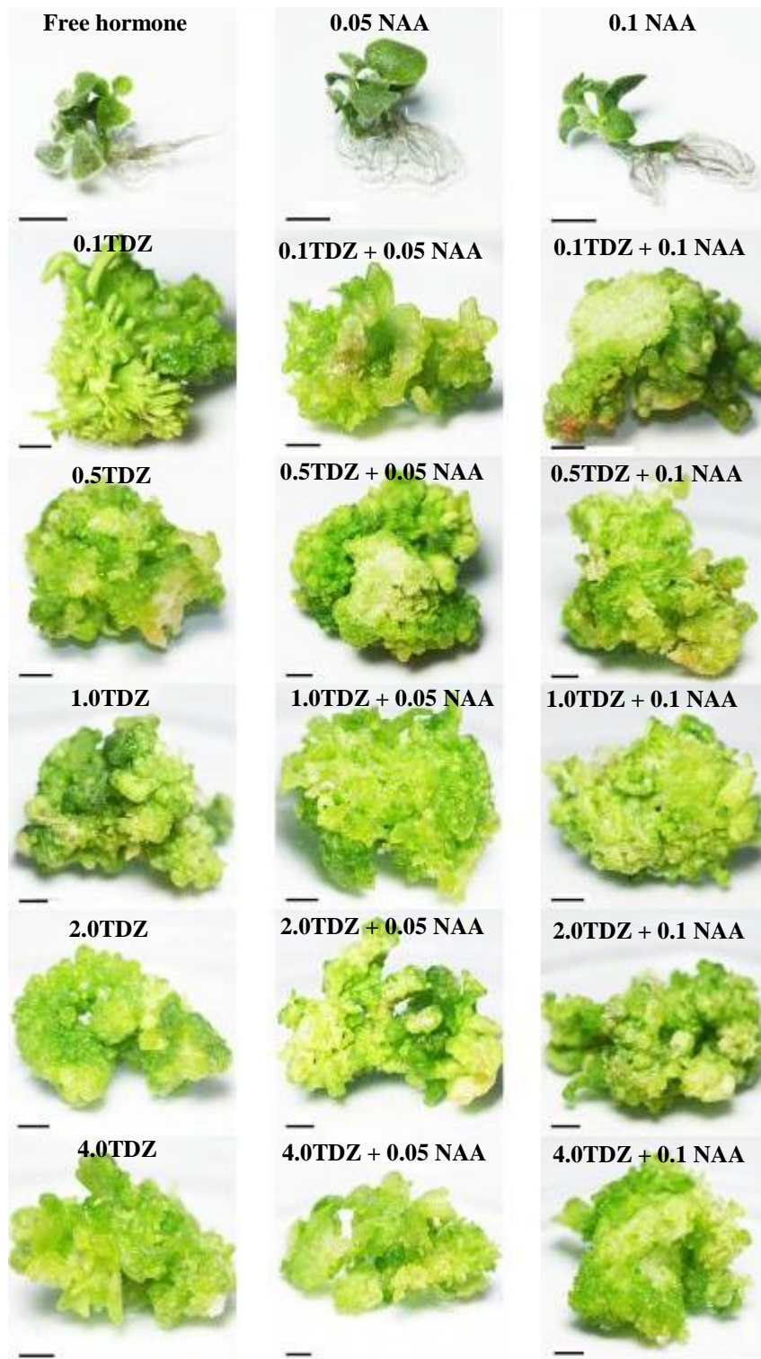
Fig. 3 Effect of TDZ and NAA on growth and development of Kalanchoe rhombopilosa explants after cultured for 8 weeks (bar = 5 mm)