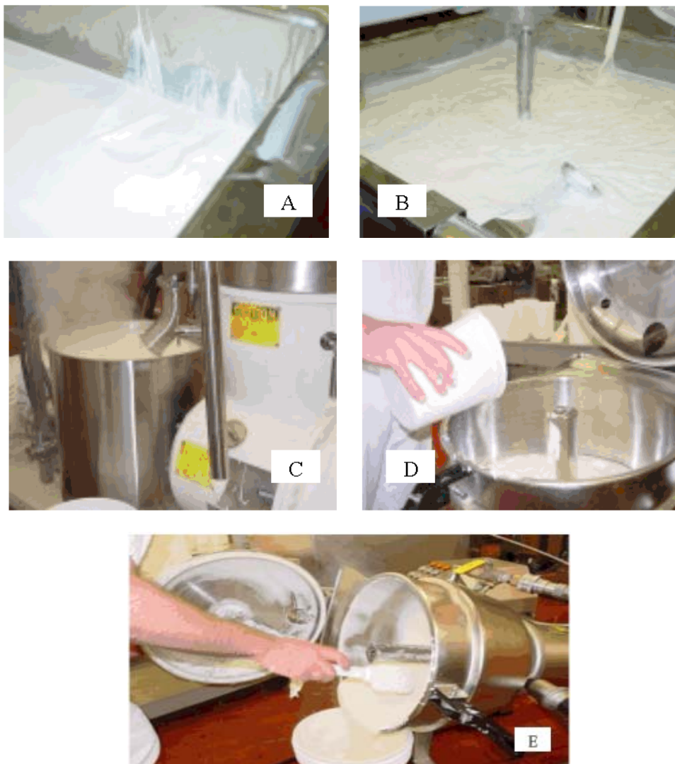
Figure 2. Cream cheese processing steps

A) Acidified milk gel at pH 4.7-4.8; B) Stirring and heating to get ready for whey separation step; C) Whey separation by centrifugal cream cheese separator; D) Mixing with salt and stabilizer and shearing; E) Hot-pack cream cheese