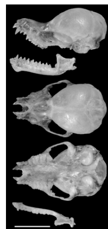
Figure 3. Lateral, dorsal and ventral views of the skull of K. krauensis , PSUZC-MM2013.50, ♂, Hala-Bala Wildlife Sanctuary, Thailand. Scale: 5 mm.

Kerivoula krauensis was included as 'Data Deficient' in IUCN (Chiozza, 2008). Subsequently, Francis (2008)