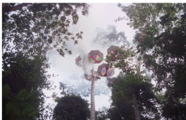
Figure 2. Insecticide fogging and umbrella bags, applied for collecting ants on tree canopies. Ant identification and data analysis

Each site was established in a permanent plot of 100x100 m 2 . The plot was divided into 100 small quadrates of 10x10 m 2 . Every two months (November 2001 - November 2002), three randomly selected small quadrates (non-repeated sampling) were sampled. Using 10 umbrella bags (2 m 2 /umbrella bag) and fogging equipment (SWINFOG ® model SN 50) which were hauled to the canopies. The pyrethroid insecticide was mixed with diesel in the ratio of 1:49 and was fogged into the canopies (15-30 m height) in the morning about 6.00 am for 20 minutes/tree (Figure 2). After 2 hours, fallen ants were collected and they were