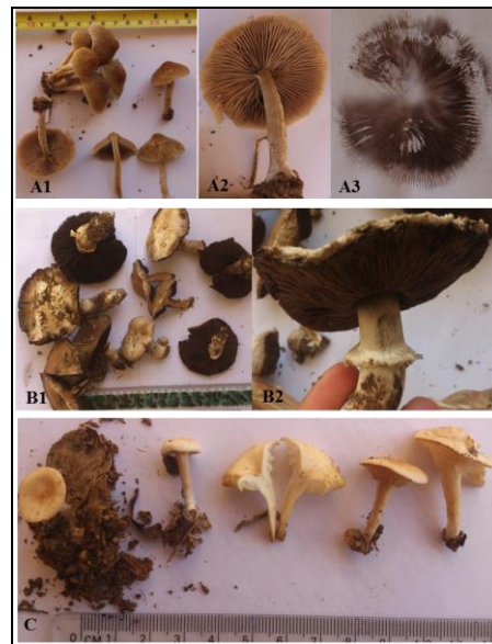
Figure 2. Wild mushrooms were collected from Heet district, Iraq; A= Marasmius sp., A1 & A2 =fruiting body, A3 = spore print; B1 & B2 = Agaricus spp.; C= Clitocybe sp.

Clitocybe sp. (Figure 2, C) may be poisonous fungus and has properties as mentioned by Huffman et al. (2008). A species Clitocybe odora also with a convex cap has a gray-brown color, darker at the center, cap 3-6 cm, gill many, stems short 1-4 cm long. They found in pastures among trees in the early spring season, edible fungi (Aziz & Toma, 2012). Clitocybe dealbata , a poisonous species, may be found in the same area with M. oreades (Huffman et al. , 2008). While, agaricus campestris and Marasmius oreades are highly recommended edible species, however, Clitocybe molybdites is poisonous (Huffman et al. , 2008).