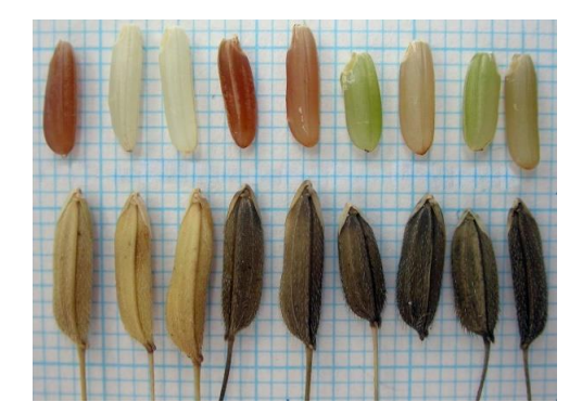
Figure 1. Examples of weedy rice seeds with straw and black hull used in this study.

Most varieties of rice have white grains, but some varieties have brown, red or black grains. Red grains are characterized by red pericarp due to the deposition and oxidative polymerization of proanthocyanidins (Furukawa et al. , 2006). Red pericarp was associated with coding sequence of the Rc gene located in chromosome 7 (Sweeney, Thomson, Pfeil, & McCouch, 2006). Rc was the dominant red allele that differed from the recessive white allele by a 14-bp deletion