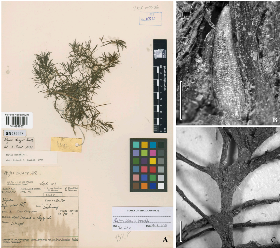
Figure 1. Najas kingii (BKF: SN076057): A. a whole plant; B. seed coat morphology; C. leaf sheath morphology. Scale bar = 1 mm.