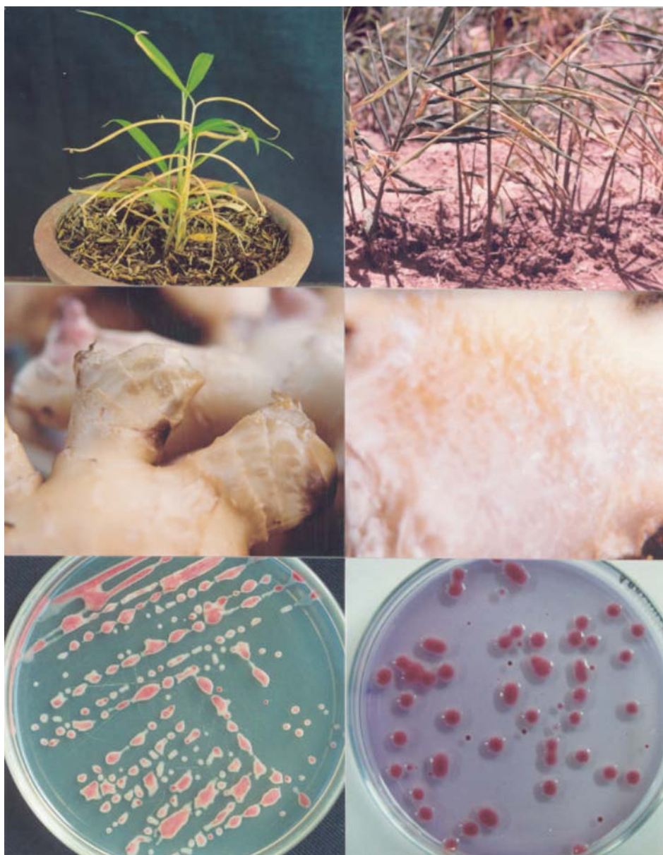
Figure 1 Bacterial wilt or rhizome rot of ginger, symptom and colony of R. solanacearum . Tested ginger transplanted in the infested soil showing inward curling and complete yellowing in 4 days. Typical wilt symptom in the ginger field occurred during rainy-season. Rhizome of the infected ginger showing water soak area in the succulent part. Milky bacterial ooze exuding from the cut rhizome. Virulent colony of R. solanacearum on TZC medium formed an irregularly round, fluidal, white with pink in center. Virulent colony of R. solanacearum on SM1 medium formed round, pulvinate, fluidal and tan in color.