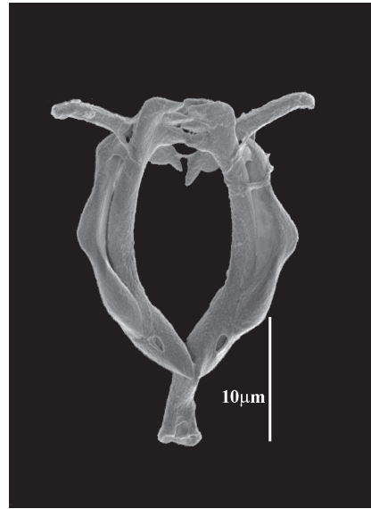
Fig 1. The SEM picture of Dicranophoroides sp. A trophi.

Trophi forcipate is symmetrical. Rami had subbasal